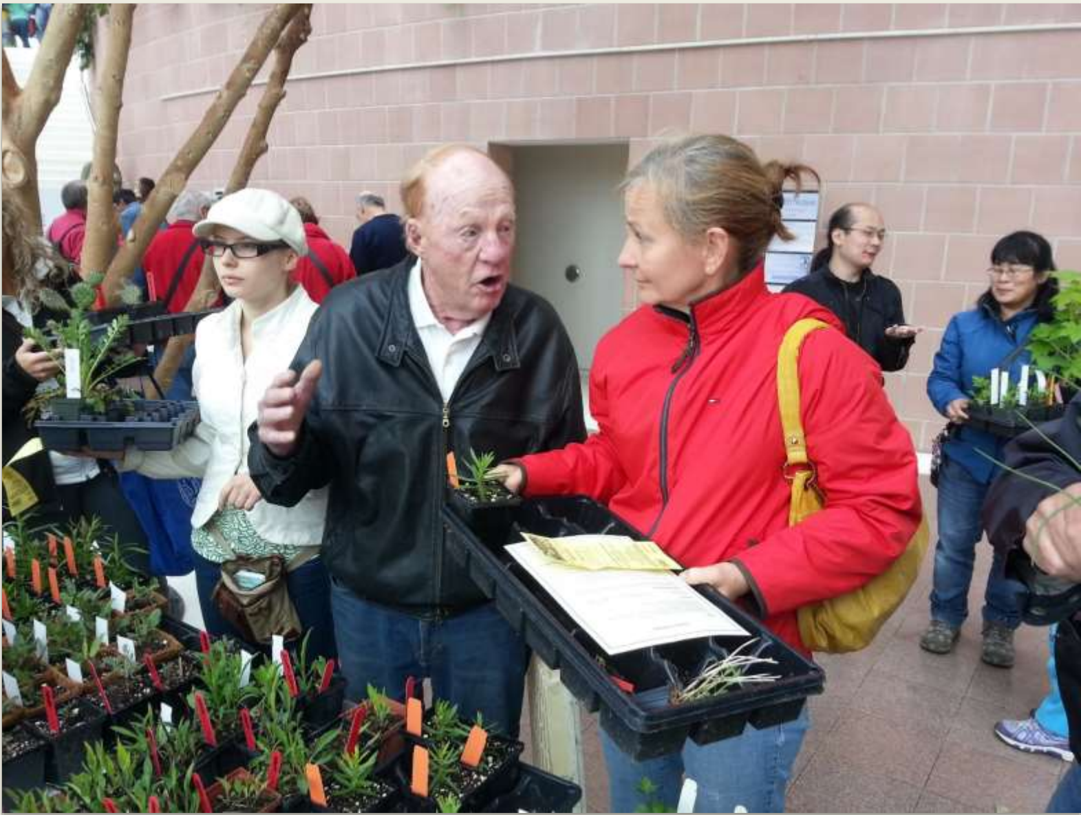
PLANT SALE: Markham Civic Centre, early may